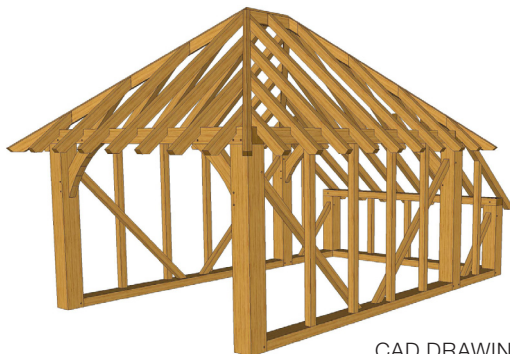
CAD DRAWING OF THE OAK KIT